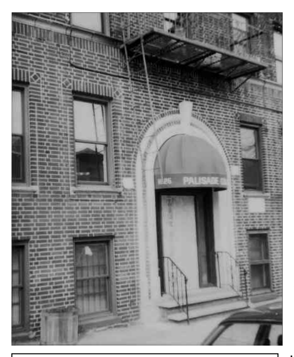
Figure 3 - View showing fire escape ladder on Division "A" where FF Velez fell

began to climb down the ladder, which was a vertical drop-down type suspended by a cable over a pulley and counterbalanced with a weight on the end of a cable. This type of ladder is not secured tightly to the fire escape frame, rather it moves vertically through a set of guides at the fire escape landing and is not secured at all at the bottom of the ladder. At about the point when Velez was two rungs down from the top of the ladder, his weight caused the heel of the ladder to suddenly shift horizontally across the doorway of the front entrance below. Velez lost his grip on the ladder and began to fall backward. Still holding the child inside his coat, he hit his head on an adjacent second floor windowsill and fell to the sidewalk fifteen feet below. It was at this point that FF Viscardo was crossing the street to help Velez with the rescue effort and he witnessed Velez falling from the ladder. As Velez landed on his back, on top of his SCBA cylinder, the child was dislodged from his coat due to the impact of the fall and landed on the sidewalk approximately