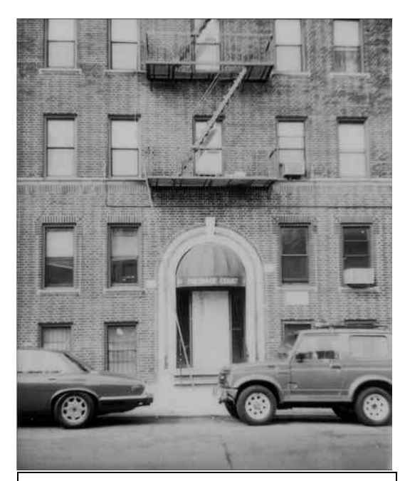
Figure 2 - View of 1625 Palisade Ave. shown from Division "A"

there were multiple fires burning inside the structure and that it appeared they were intentionally set. He also requested that NBFD units assist with rescue and evacuation efforts at the scene.