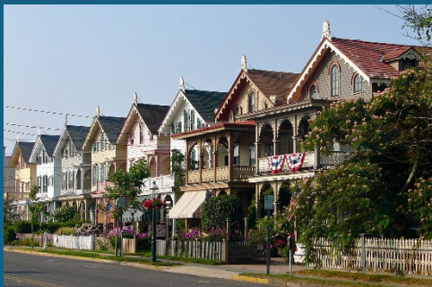
Cape May Historic District