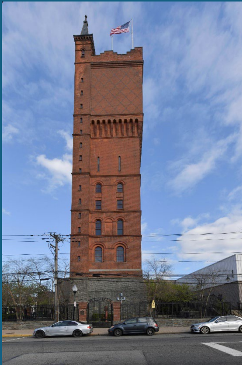
Hackensack Water Company

• Rail Trail, Camden County - The Camden County Link Trail is a planned 34-mile multi-use, off-road trail designed to serve as the “spine” for a County-wide trail network. In 2017, the County completed a feasibility study for this spine, known at that time as the Cross Camden County Trail. The result was a trail alignment that travels through seventeen municipalities from the Benjamin Franklin Bridge in Camden to the Gloucester County line in lower Winslow Township. Along the way, the trail specifically connects numerous heritage sites – not only promoting heritage tourism across county lines but also providing an eco-friendly way to access them.