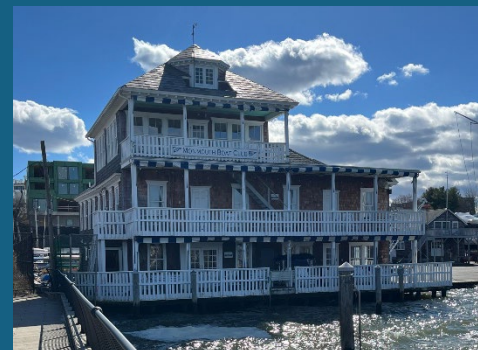
Monmouth Boat Club