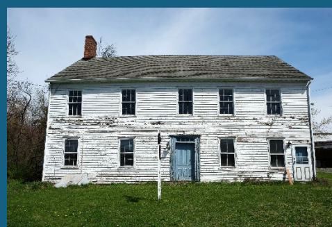
Van Liew Farmhouse