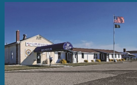
Millville Army Airfield Museum