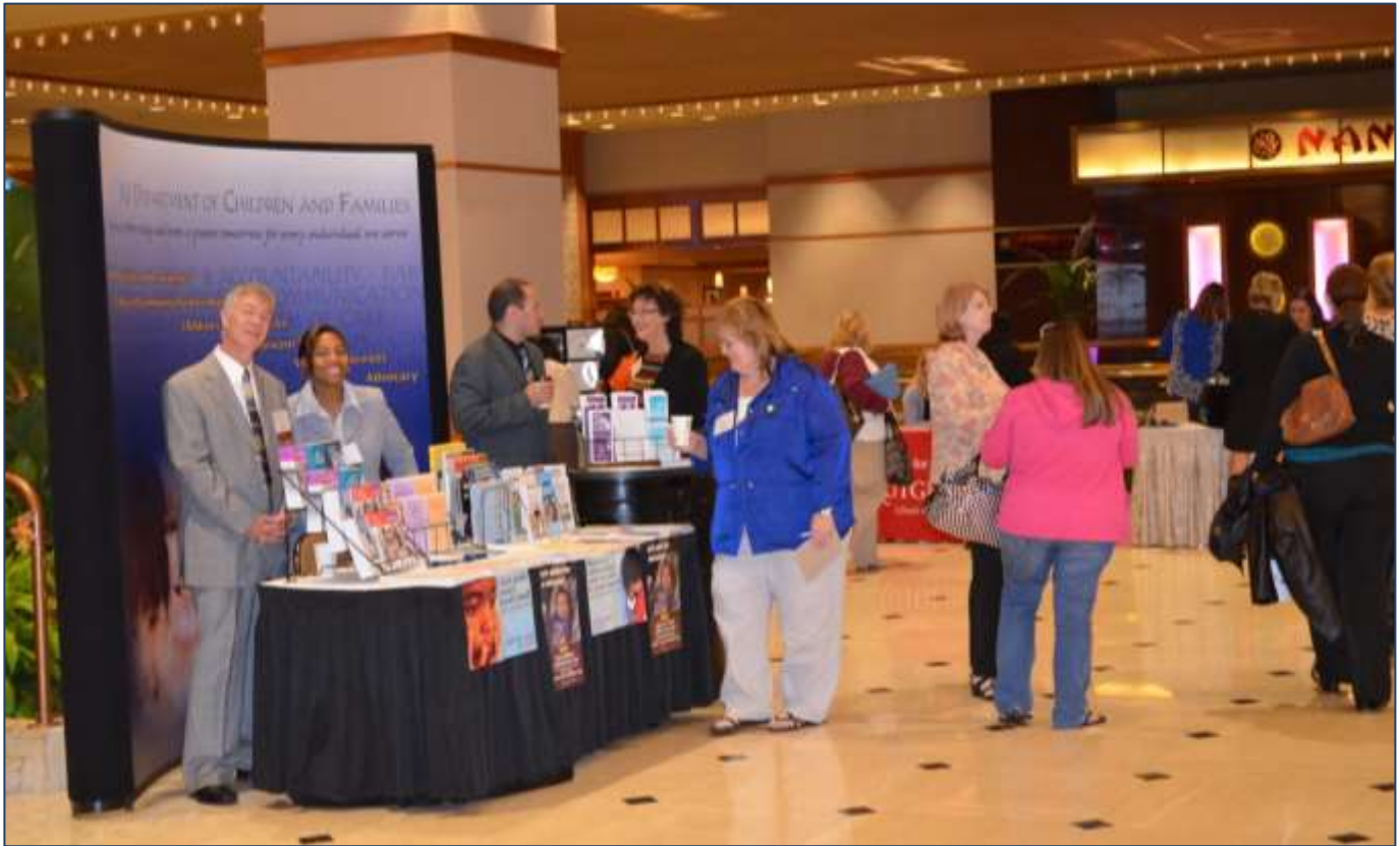
2013 New Jersey Taskforce Biennial Conference, "Transitions: From Infancy to Adulthood"

The Task Force is currently preparing for its skill-building conference on trauma-informed care in September 2014.