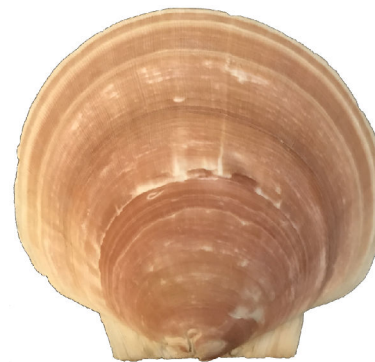
Sea Scallop ( Placopecten magellanicus )