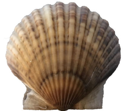
Bay Scallop ( Argopecten irradians )