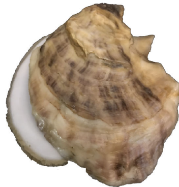
Eastern Oyster ( Crassostrea virginica )