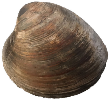
Hard Clam ( Mercenaria mercenaria )