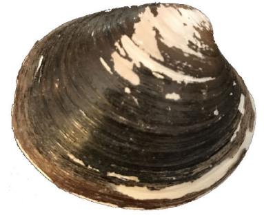
Ocean Quahog ( Arctica islandica )