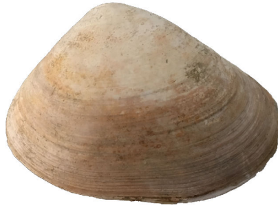
Surf Clam ( Spisula solidissima )