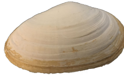
Soft Shell Clam ( Mya arenaria )