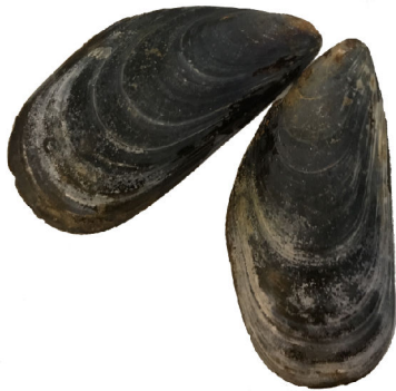
Blue Mussel ( Mytilus edulis )