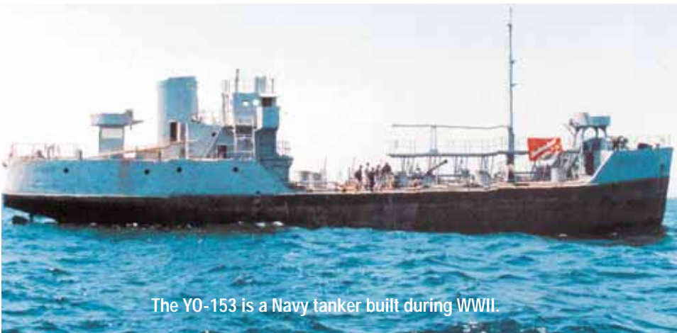
The YO-153 is a Navy tanker built during WWII.

... the vessel is being sunk by cutting holes in the hull and opening the engine room sea cocks. . .