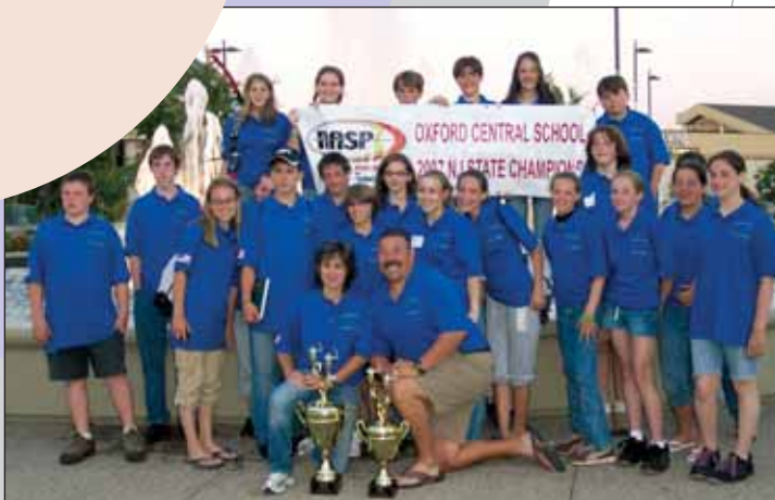
New Jersey state champions from the Oxford Central School proudly display their National Archery in the Schools trophies after their successes at the national competition in Kentucky.