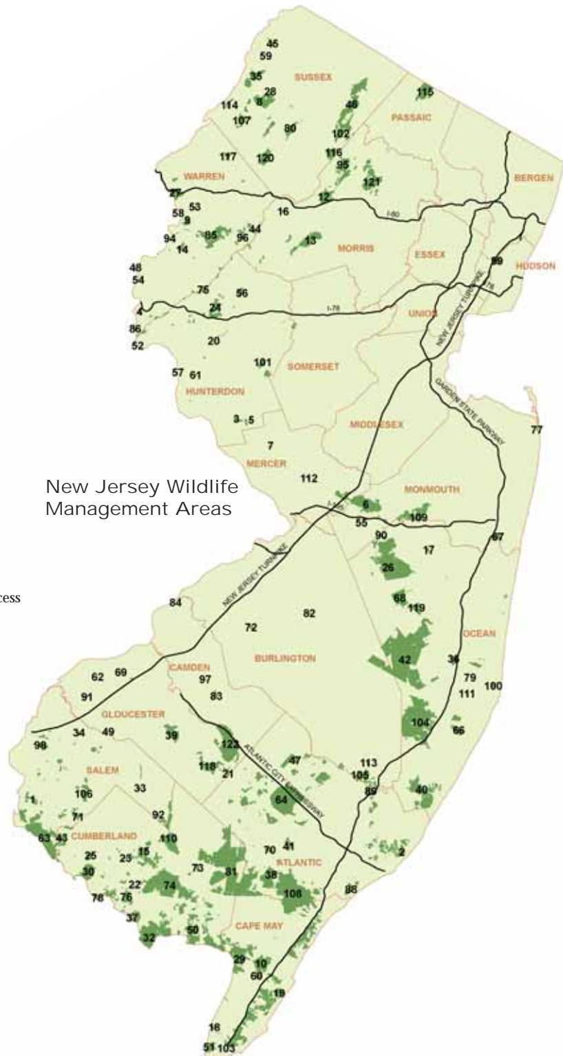
New Jersey Wildlife Management Areas

New Jersey Department of Environmental Protection (DEP) has a new Web-based tool called i-MapNJ.