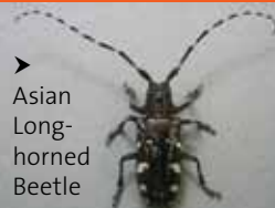
▶ Asian Long-horned Beetle