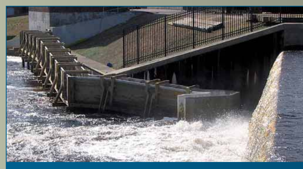
Completed Fish Ladder, Great Egg Harbor, Lenape Lake-

Unfortunately, river herring have not been a high priority fishery to receive dedicated research and management funds. To restore this fishery, that approach must change. Regrettably, when January 1, 2012 arrives and the river herring harvest moratorium goes into effect, anglers will no longer have access to these formerly abundant baitfish. The ramifications of their decline reaches far beyond a day fishing with family or friends.