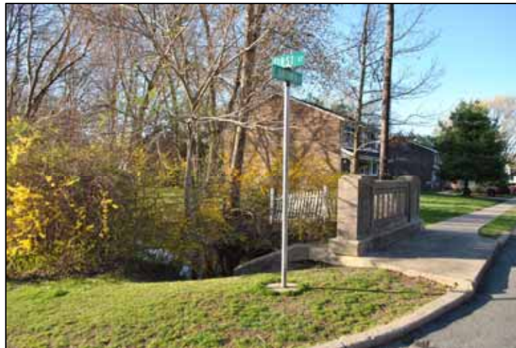
Above: Trout Brook at intersection of 1 st and Baldwin St. on 4/7/2012; Left: Trout Brook fishing conditions near Charles St. on 4/7/2012