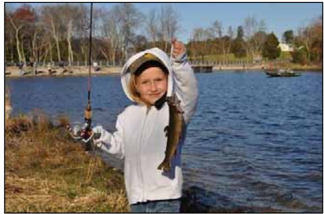
Shaws Mill Pond on 4/7/2012

Traditionally, anglers kept their catch in a wicker basket, also known as a creel. Even though anglers commonly opt to store their catch on a stringer or in a cooler, the term creel still refers to what an angler has caught. Angler Surveys enable the Bureau of Freshwater Fisheries to gather information about angler success, fishing preferences, interests, and attitudes not only about trout stocking but also about the Division’s Freshwater Fishery program. The intent of this type of data is to provide the Division with information to better understand anglers, provide better service, and ultimately improve fishing throughout New Jersey.