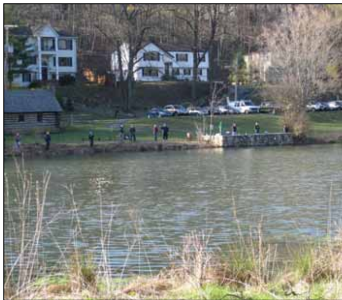
Burnham Park Pond on 4/7/2012

gauge angler turnout and to keep continuity in data that has been collected in the past.