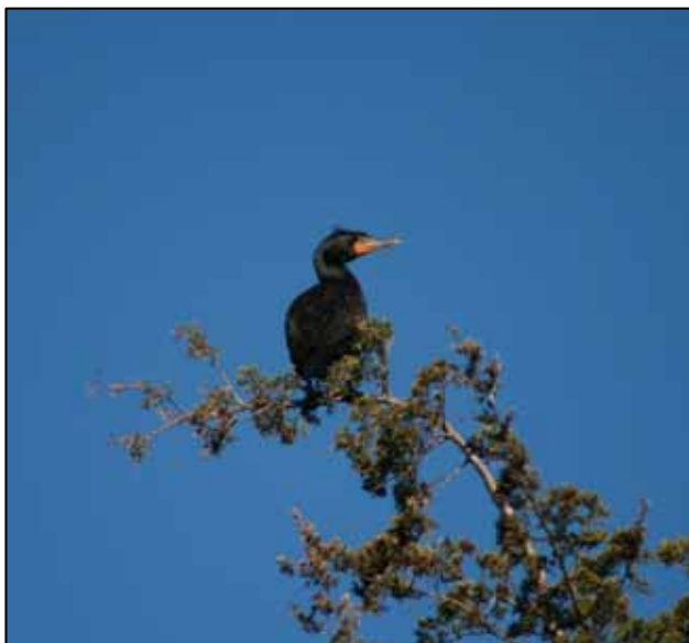
Echo Lake cormorant on 4/7/2012

Angler counts are made at 8 a.m. when the trout season opens. All individuals who are fishing and about to fish are counted by angler survey clerks to help determine angler turn-out. Counting children (under 16 years) and anglers on boats is also done to provide more in depth information to the Division. Getting to a good vantage point and binoculars can be very helpful. Total counts of anglers fishing are made at 8 a.m., 10 a.m., 11 a.m., and 12 p.m. The counts made at 8 a.m. are used to