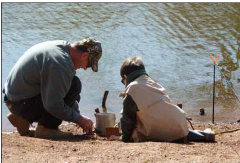
Roosevelt Park Pond on 4/7/2012

A complete list of Opening Day angler turnout (including surveys conducted on streams or rivers) can be found in Table 2 along with trout catch information. Musconetcong River (Stephens State Park) and Ponderlodge Pond anglers were very successful catching 390 and 134 trout, respectively. Waterbodies that had "slow" fishing included Clinton Reservoir (1 trout caught) and Holmdel Park Pond (9 trout caught). Musconetcong River (Stephens State Park), Ponderlodge, Manny's Pond, Seeley's Pond, and Shaws Mill Pond saw the most trout caught on Opening Day.