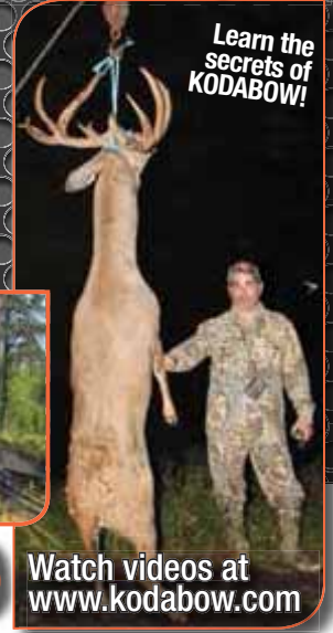
Learn the secrets of KODABOW!