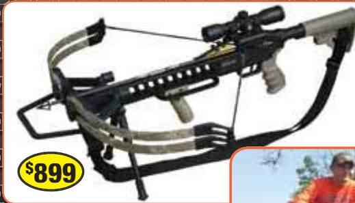
The 185 lb Koda-Express and 200 lb Bravo Zulu are popular hunting bows.