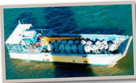
In the shadow of Old Barney —Captured from atop the lighthouse as it passed by, landing craft Benjamin Maybe transports 50 reef balls to the Barnegat Light Reef.

Although the conflicts that arose between recreational and commercial fishers using potting gear were an unfortunate outcome, the measures proposed by the DEP to ameliorate access issues should satisfy federal officials from the Sport Fish Restoration Program. It is anticipated that our federal funding will be restored by the spring of 2016 and that New Jersey's Reef Program will once again set the gold standard for other states to follow.