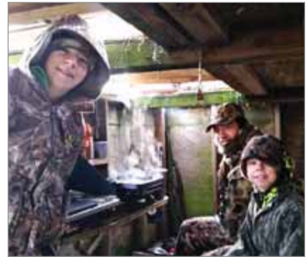
Cooking breakfast in the goose blind.

There is a powerful feeling from providing food for the family from the field. Cook it the way the new hunter prefers. Jerky, snack sticks and other specialty meats may be more exciting to them than cooking roasts or steaks on the grill. Whether it's a single meal from that first pheasant or filling the freezer by harvesting a deer, young hunters can celebrate an accomplishment that very few other kids will claim.