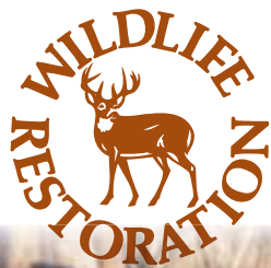
Craig Emon/NJ Div. Fish & Wildlife