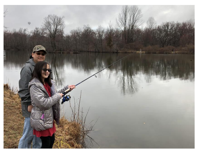
Manny's Pond Hunterdon County, 4/6/2019

Many anglers who fish on Opening Day of trout season may already be familiar with the Bureau of Freshwater Fisheries use of angler surveys given that this tool has been utilized since 2004 on about 120 trout stocked locations throughout the Garden State. So, if you fish on Opening Day, you may