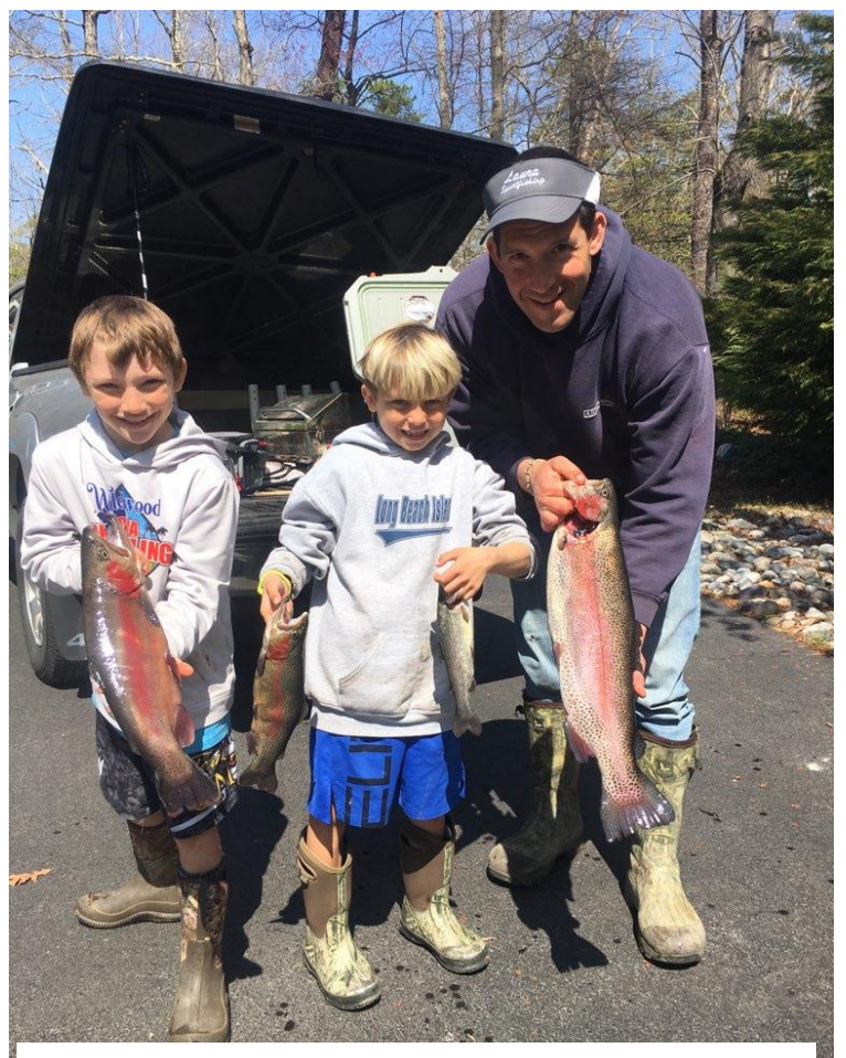
A father and his sons showing off their successful day at Sylvan Lake on opening day of the 2019 trout season.

A complete list of Opening Day angler counts on streams and rivers can be found in appendix of this report along with information on angler success.