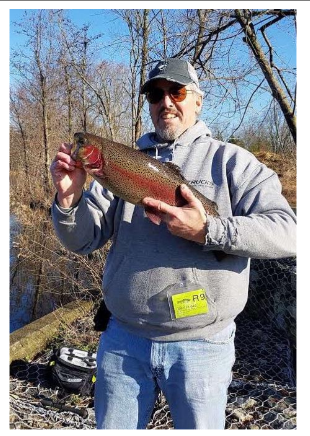
Broodstock Rainbow Trout caught at Whites Pond Bergen Co. on opening day. Photo Credit: Stephanie Rogacki, 4/06/2019

A complete list of the 2019 Opening Day angler success on the lakes and ponds can be found in the appendix of this report along with information on angler success.