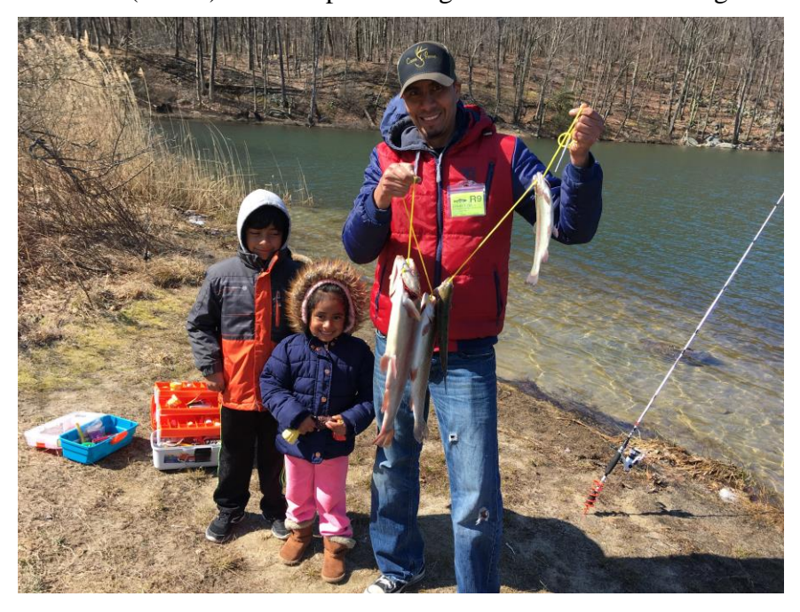
Angler and his family having a great day at Mt. Hope Pond. Photo Credit: Hung Le, 04/06/2019

7 different lakes and ponds produced less than 5 total fish during the 4-hour survey time period. Of those 7 waterbodies, 6 of them had more than 10 anglers fishing while 1 was less popular and had less than 10 anglers fishing. We would have liked to see higher turnouts and possibly