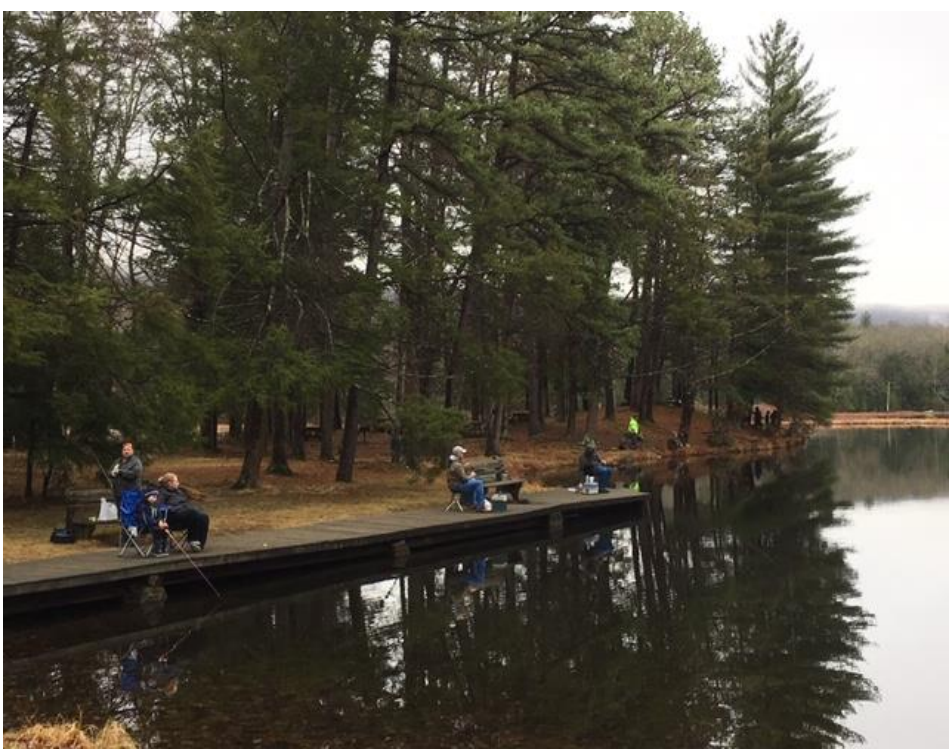
Stony Lake, 4/6/2019

All individuals fishing are counted by survey clerks to help determine angler turnout. Counts are conducted hourly from 8 a.m. until noon. From the five counts made, the highest number of anglers is used as the indicator of angler turnout. One limitation in hourly counts is that turnover is not taken into account. For example, if 10 anglers leave the waterbody, and 10 new anglers arrive, the count would still be 10. This is done because the survey clerks would have a difficult time keeping track of all anglers coming and going, especially on large waterbodies, as they drove between different locations interacting with anglers.