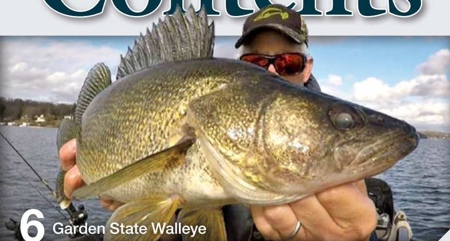
6 Garden State Walleye