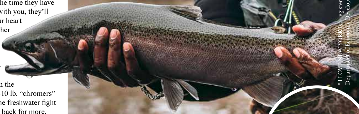
© I LOVE NEW YORK is a registered trademark and service mark of the New York State Department of Economic Development; used with permission.

Let this be your year to experience the legendary waters of the Salmon River -- long regarded as one of North America's premier steelhead destinations!