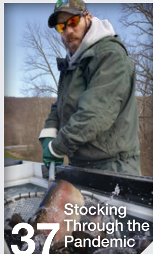
37 Stocking Through the Pandemic