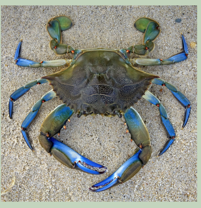
A Great New Jersey favorite!