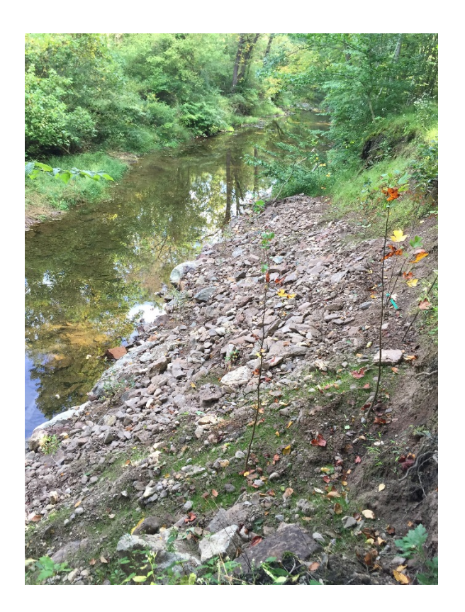
Restored bank, looking downstream, with completed riparian buffer plantings.