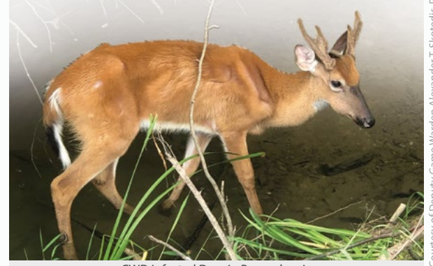
CWD Infected Deer in Pennsylvania