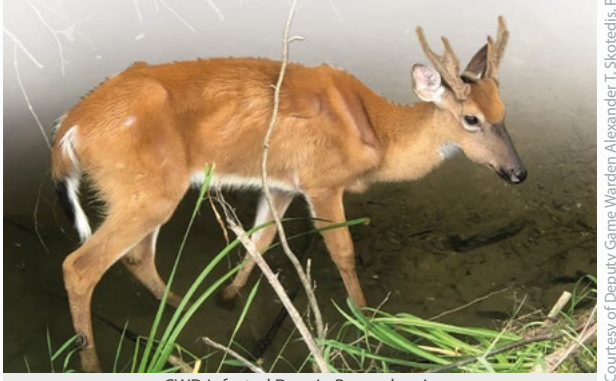
CWD Infected Deer in Pennsylvania