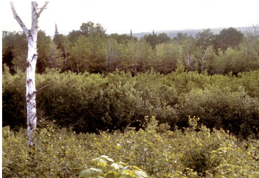
Figure 1. Regenerating stands of forest in the seedling/sapling (foreground) and pole stages (middle of photo) provide excellent habitat for many species dependent on early-successional habitats.

Second, the regeneration stage, in terms of age, starts right after a timber harvest or other type of disturbance and lasts from 10 to 15 years depending on which forest type, or forest community, is involved. Young forest habitat starts at age 10 to 15 years and continues to 40 or 50 years, again depending on the community involved.