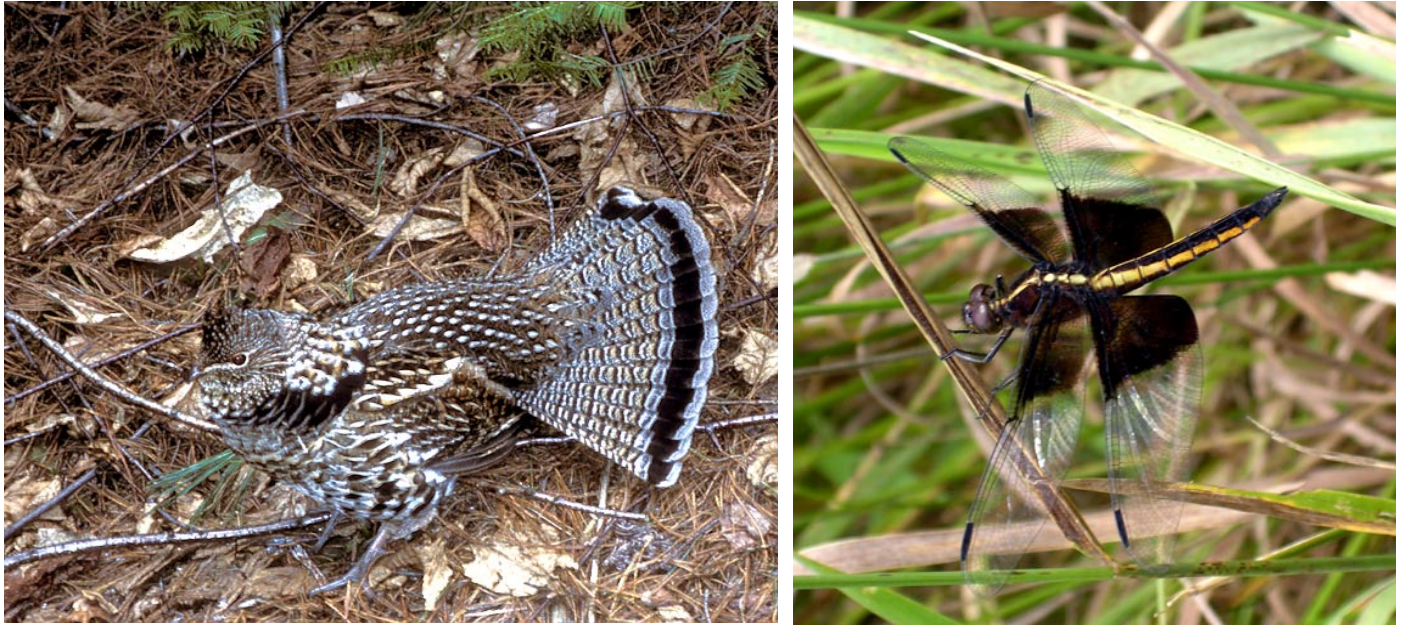
Figure 2. Mid- and large-sized land holdings are appropriate for managing species with moderately-sized home ranges like ruffed grouse (a). However, even properties of ten acres or less can be effectively managed for many wildlife species including dragonflies (b), which act as an important prey base for many species.