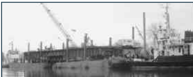
The Rancocas Creek bridge swing span being transported downstream on barges to its temporary storage site in Gloucester.

indicative of a generally positive group consultation effort between the HPO, and Transit and its prime contractor, Bechtel Infrastructure Corporation, that will continue throughout the project duration. Recent consultation has resulted in achieving significant mitigation milestones, such as the design of historically sensitive and evocative station stop platform canopies and furnishings, the inventory and proposed reuse of numerous historic railroad artifacts, and the incorporation of a concrete bridge repair color and texture matching program. Probably the greatest mitigation effort is NJT's attempt to market and relocate the largest bridge span within the project alignment - the steel multi-girder swing span crossing the Rancocas Creek between Riverside and Delanco.