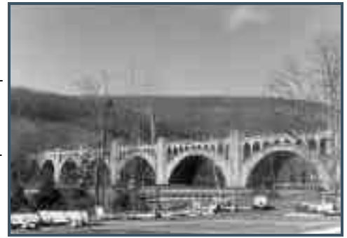
The reinforced concrete open spandrel arch bridge across the Delaware River between NJ and Pa is a significant feature of the 28-mile long Delaware, Lackawanna, and Western Railroad New Jersey Cut-Off Historic District.

Future activities include identifying potential effects, avoidance/minimization alternatives, and (if appropriate) mitigation treatments where adverse effects may be unavoidable for a range of typical transportation project construction activities. Federal Transit Administration and New Jersey Transit staff will actively participate in the project during this coming year and the results of this project will be linked to ongoing project consultation with New Jersey Transit.