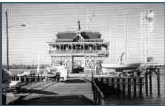
The rehabilitation of the failing below water level bulkhead of the Riverton Steamboat Landing, Riverton Borough, Burlington County, threatened by deterioration and erosion, will ensure the preservation the above water level facility.

On February 2, 2000, NJDOT Commissioner James Weinstein announced the award of $12 million in transportation enhancement projects, for thirty five projects statewide, funded through the federal Transportation Equity Act for the 21st Century (TEA-21). Consistent with the TEA-21 vision that transportation initiatives respect the natural and built environment characteristics of our communities, transportation enhancements include such non-traditional transportation projects as creation of bicycle and pedestrian paths and trails; rehabilitation of historic canals and railroad stations; rehabilitation of transportation related buildings such as lighthouses, taverns, inns, and transportation manufacturing facilities; and improvements to downtown streetscapes.