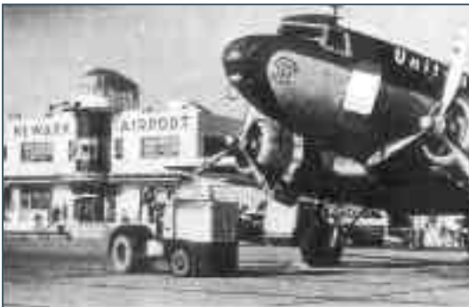
Historic Photo - Newark Airport

In 1980 the Historic Preservation Office prepared a nomination for the early buildings of Newark Airport, including the 1935 Airport Administration Building (now called Building 51). When Building 51 was completed, Newark Airport was arguably the most important airport in the world. The ribbon cutting ceremony was attended by Amelia