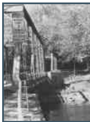
HIGGINSVILLE ROAD BRIDGES, HILLSBOROUGH TOWNSHIP