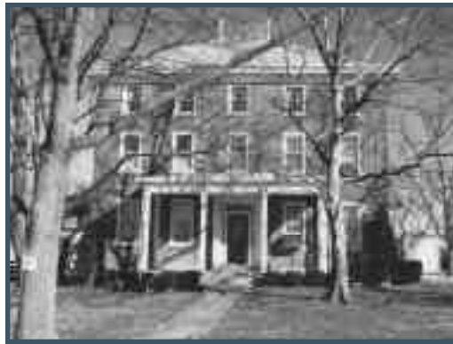
The Hackett house in Mannington Township, Salem County, now protected under preservation easement.