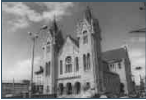
ST. NICHOLAS OF TOLENTINE CHURCH, ATLANTIC CITY