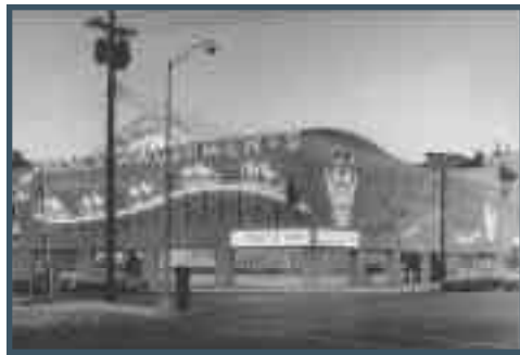
PALACE AMUSEMENTS, ASBURY PARK