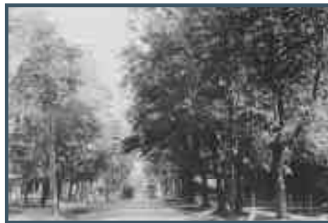
KING'S HIGHWAY HISTORIC DISTRICT, LAWRENCE TOWNSHIP, PRINCETON BOROUGH & TOWNSHIP