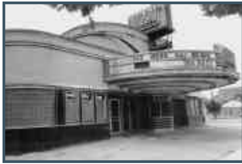
LANDIS THEATRE, VINELAND CITY