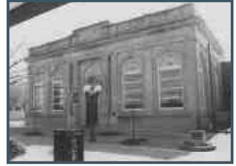
MARINE NATIONAL BANK, WILDWOOD CITY