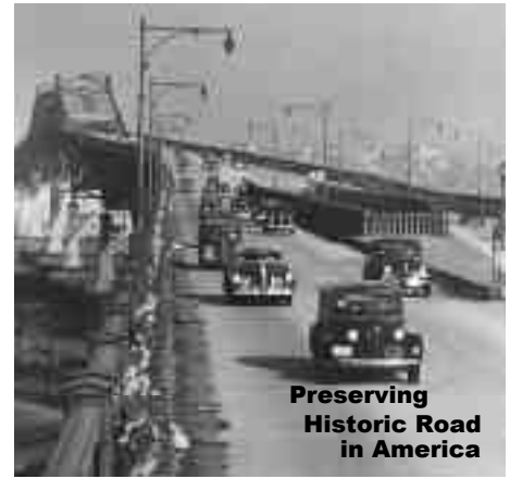
Preserving Historic Road in America

The 3rd biennial Preserving the Historic Road in America conference will be held in Omaha, Nebraska in April 2002. Like its predecessors in Los Angeles, CA (1998) and Morristown, NJ (2000), it promises to be an energetic and engaging meeting.