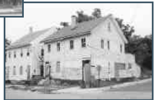
Typical of the houses in the Hedge-Carpenter-Thompson Historic District, these houses along with approximately 150 others, will be rehabilitated using the Investment Tax Credit.