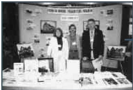
Members of the Evesham Township Historic Preservation Commission attend a CLG funded information booth at the Annual NJ League of Municipalities conference.