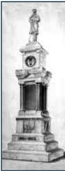
Rendering of Newton's Civil War Monument, erected in 1895. Illustration courtesy of Wayne McCabe.