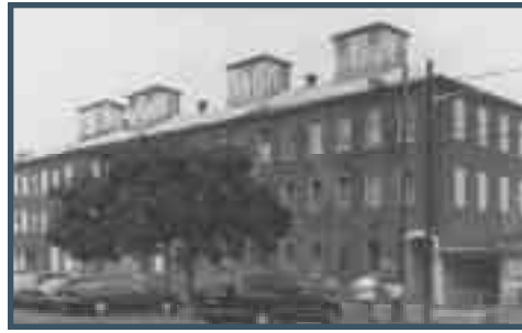
J.F. BUDD BABY SHOE FACTORY, BURLINGTON CITY