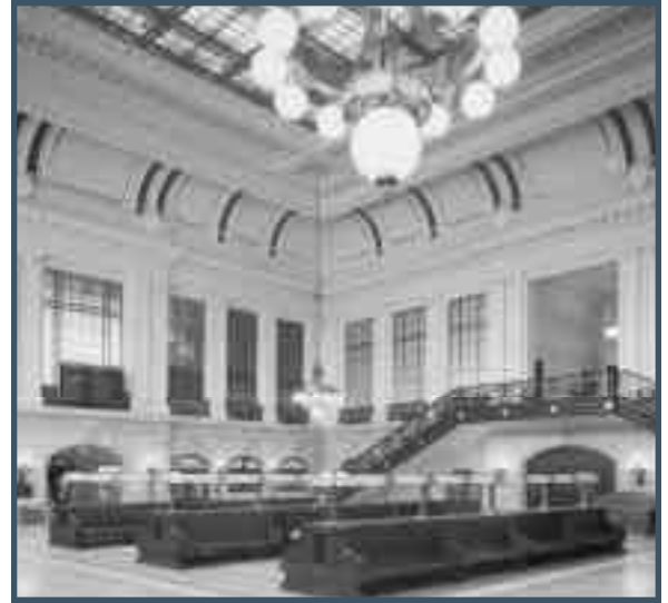
Erie-Lackawanna Terminal Main Waiting Room Hoboken 2000

Those treasures include 49 individual buildings in the New Jersey and National Registers of Historic Places, with an additional eight buildings determined eligible for listing. This fact makes NJ Transit the largest historic property owner of all transit agencies in this country. In the past six years, NJ Transit has spent $42.2 million restoring 14 station buildings and plans to spend another $59.1 million to continue work at Hoboken Terminal, Newark Penn Station and other stations. With NJ Transit's continuing support of preservation on the rails, we can all look forward to more remarkable restorations.