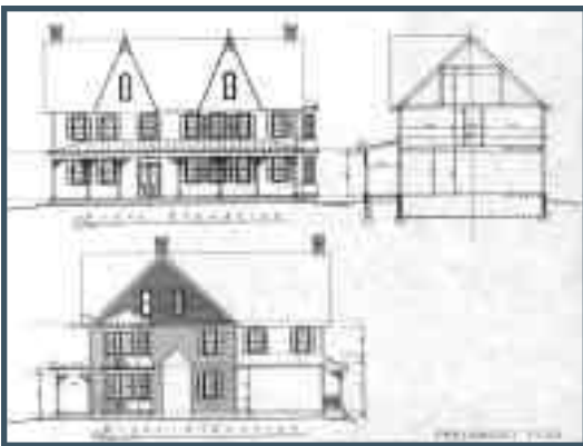
Berlin Hotel Berlin Borough, Camden County, a former hotel/stage coach stop will be rehabilitated for public community use as an annex to the Berlin Public Library.