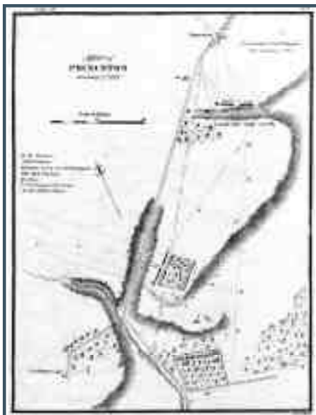
"Affair of PRINCETON" is an example of a visual primary document that will be implemented in the ABPP survey.

New Jersey has a vital commitment to insure a positive outcome of the ABPP within the state. During this past year the Historic Preservation Office has devoted