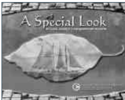
The NJDOT publication "A Special Look at New Jersey's Transportation System" includes many illustrations of projects involving historic bridges, railroad stations, maritime resources and historic and pre-historic archaeology.