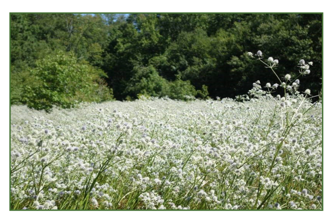
Spectacular show of rattlesnake master blooming in the Bennett Bogs' North Pond.