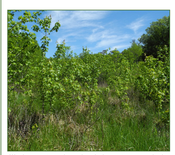
Woody vegetation such as red maple threatening to overtake the meadow habitat of many rare plants.

Nature then took its unyielding course. Young trees and shrubs moved in and took hold. As the years rolled by, woody vegetation came to dominate much of the North and South ponds. Button bush replaced bog buttons. Persimmons pushed out Pine Barren gentians. Sweet gums and red maples threatened to overtake everything else. Between 2002 and 2015 the preserve had been mowed only once, and that was in the late summer of 2007--the one-hundred-year anniversary of the discovery of Bennett Bogs by Bayard Long and Samuel Van Pelt.