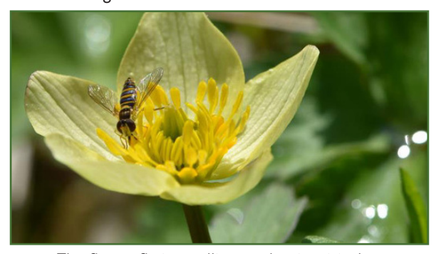
The flower fly is a pollinator that is critical to biodiversity in North America.