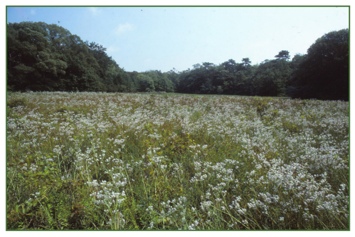
In the 1970s rattlesnake master filled the open fields at Bennett Bogs.

Much of the green did belong to grasses and sedges.