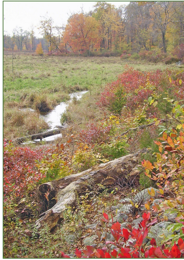
Different but equally beautiful views of the Reinhardt Preserve.