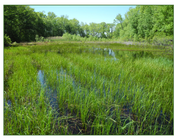
The north pond at Bennett Bogs is wet through most of the year.

There's a notion that once habitat has been legally preserved the species that depend on it are now protected and will be just fine if left alone. Unfortunately, that's not always true. Ironically many natural places need a little nudge or help from humankind to maintain their place in this world. Bennett Bogs is one of those places. And the nudge that works at Bennett Bogs is mowing, which had been happening there for more than a century with no obvious damage to the rarer plants.