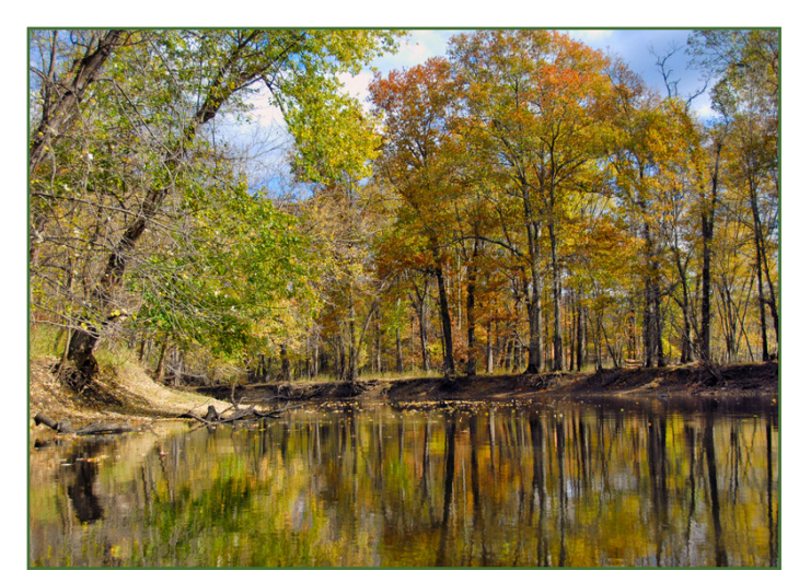
Peaceful Passaic River near the donation

One of the land donations to the Trust this year was itty bitty in size, at less than a tenth of an acre, but big in terms of heart.