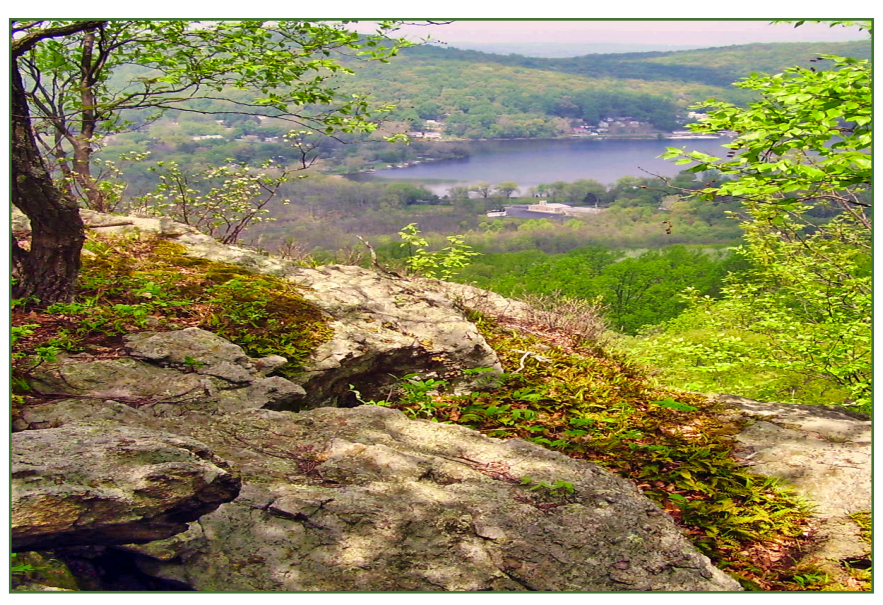
Deer hunting is permitted at the High Rock Mountain Preserve.

While hunting on Trust preserves, all rules and regulations in the New Jersey Division of Fish and Wildlife game code must be followed. Hunting deer by bow and arrow, shotgun or muzzleloader are acceptable, depending on the preserve. No target shooting or discharge of weapons other than for deer hunting purposes is permitted. Permanent deer stands are not allowed, and portable deer stands, while permitted, must be removed after the hunting season is completed or are subject to confiscation by the Trust.