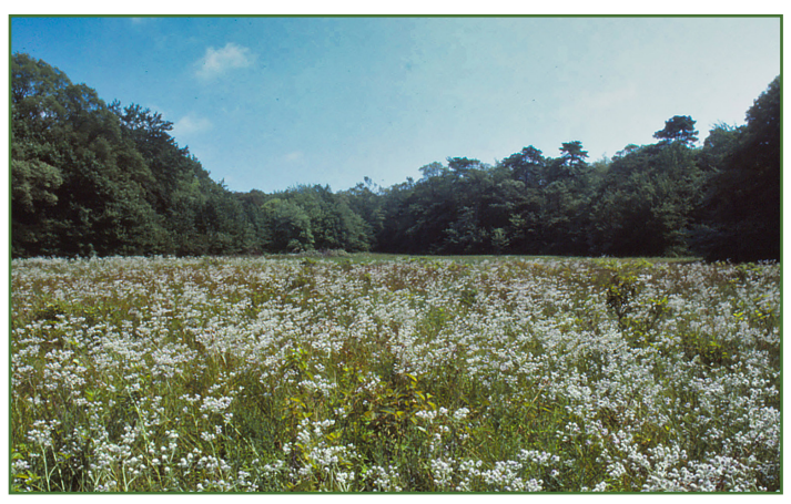
In the 1970s rattlesnake master filled the open fields at Bennett Bogs.