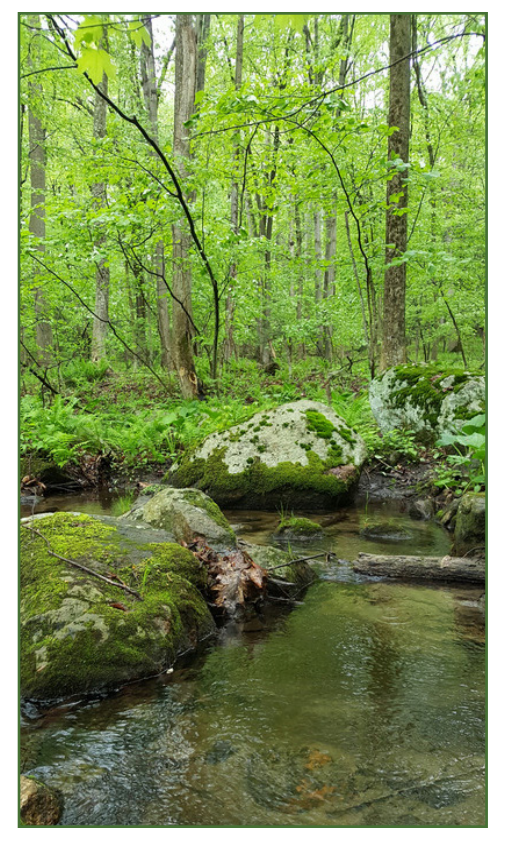
Rare mussel habitat along Bear Creek.

Over the last several years, the Trust has been carrying on an effort to inventory the diversity of species found on its preserves. As of 2018, 13 preserves have been studied, selected from over one hundred preserves with some attempt to focus on the largest, richest areas and in all geographic regions of the state, including Highlands, Pinelands and Delaware Bayshore.