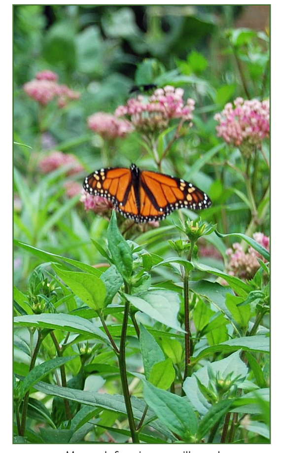
Monarch feasting on milkweed.

Thinking ahead to the Trust's 50th Anniversary in 2019, the Trust plans inventories on three more preserves. These include Sooy Place Preserve, a 1,585-acre property in the Pine Barrens of Burlington County, and a combined 388-acres to be monitored at Wallkill and Sterling Hill preserves in Sussex County.