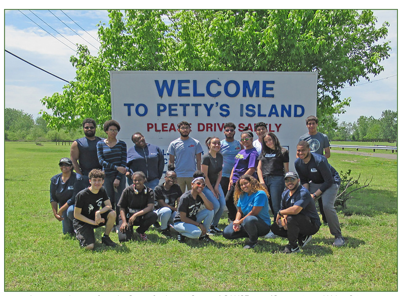
Awesome volunteers from the Center for Aquatic Sciences' CAUSE team (Community and Urban Science Enrichment) at a Petty's Island clean-up event.

The Trust would like to acknowledge and thank its many volunteers for their invaluable contributions to the maintenance of Trust preserves. If you are interested in becoming a Trust volunteer monitor or attending a workday, please contact the New Jersey Natural Lands Trust at 609-984-1339, or email NatLands@dep.state.nj.us.