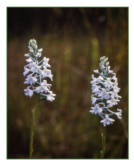
Snowy orchids last seen at Bennett Bogs in 2002.

grass, reed-grass and panic grass. Among the sedges there were spike-rushes, flat-sedges, three-way sedges, umbrella-sedges and just plain old sedges. And, hidden in the depth of this green sea of tangled taxonomic complexity, was a plant that would soon become emblematic of the as yet unnamed botanical site. It was the young Bayard Long who discovered it.