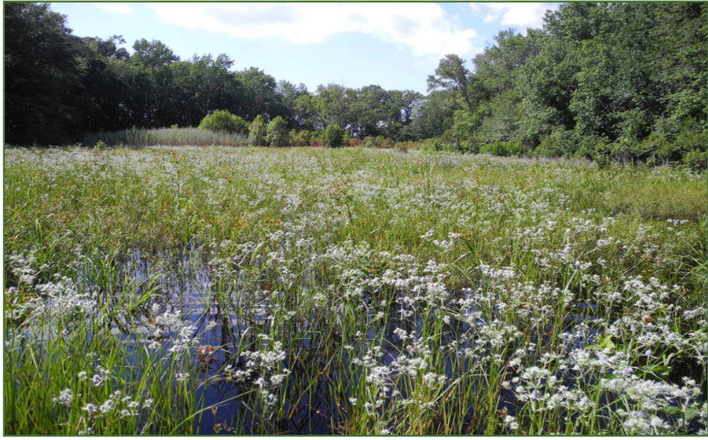
Before (top) and after restoration of the North Pond.