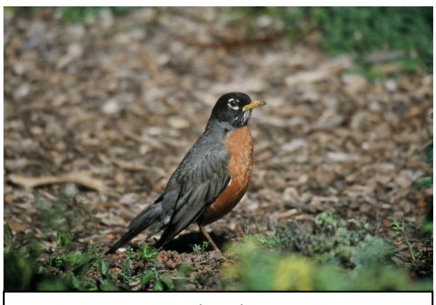
Male robin

In the crossing seasons from winter to spring, birders will bid farewell to winter migrants like the snowy owl but welcome in spring favorites like the American robin. As the snowy heads north to the Arctic, the robin reappears from its wintering grounds in the southern states and more protected inland forests. They reappear in urban areas in search of worms. Robins will also feed on berries and a variety of insects. Parks are a favorite place for robins because they like the tree and lawn balance that offer nesting sites and food close together. Robins usually lay three to five pale blue eggs in a round bowl-like nest in a tree. Liberty State Park is often home to hundreds of robins in the early spring. Watch for them along in the grassy areas along Freedom Way.