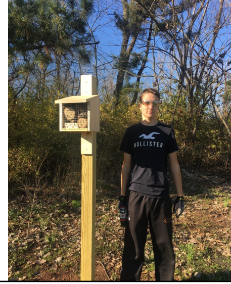
Scouts working to install pollinator boxes in Liberty State Park