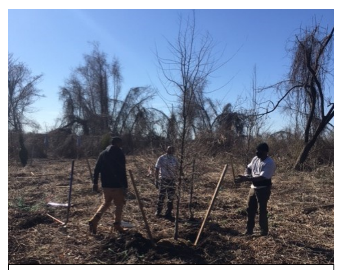
NJ Tree Foundation hard at work

This spring's planting include 15 native hardwoods along the Nature Path and some additions to the Grove of Remembrance. Many thanks to the FOLSP for their generous donation and to the NJ Tree Foundation for their expertise!