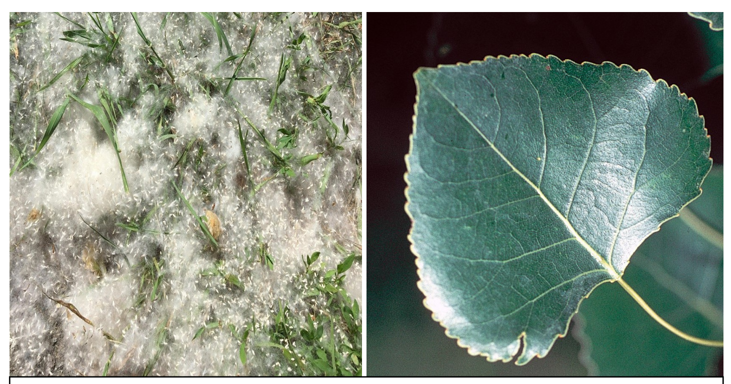
(Left) Fluffy white "cotton" seeds of the eastern cottonwood.

Eastern cottonwoods are native to North America and have existed for a very long time. Its wood is lightweight yet durable, making it suitable for building as well as pulp for paper products. Many animals eat the bark, leaves, and seeds of cottonwood trees, and birds roost and nest in the branches. Some animals also use the fluffy seeds as lining in nests and burrows.