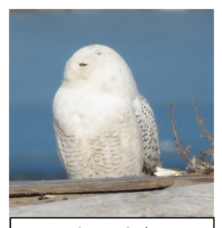
Snowy Owl