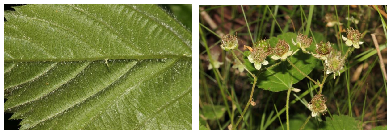
R. novocaesarius, downy underside of leaf (left) and developing fruit (right)