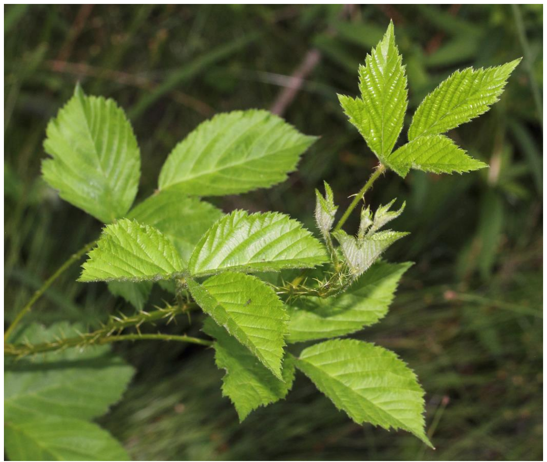
Rubus novocaesarius