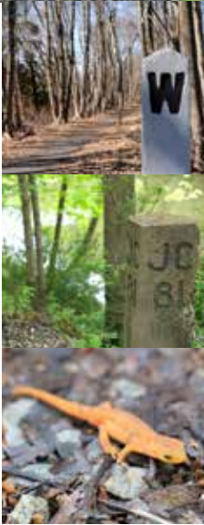
Top: Snapping turtle on the trail. Middle top: Whistlemarker used by conductors to alert oncoming traffic. Middle bottom: Jersey City mile marker Bottom: Eastern newt

During the fall, winter and spring various hunting seasons are open. While not permitted on rail-trails, hunting may occur on adjacent private and public lands. The Aeroflex section of Kittatinny Valley State Park is open for hunting and provides favorable habitat for deer, turkey and small game. Trail users should consider wearing fluorescent orange clothing to increase their visibility. Hunting is subject to New Jersey DEP Fish & Wildlife regulations.