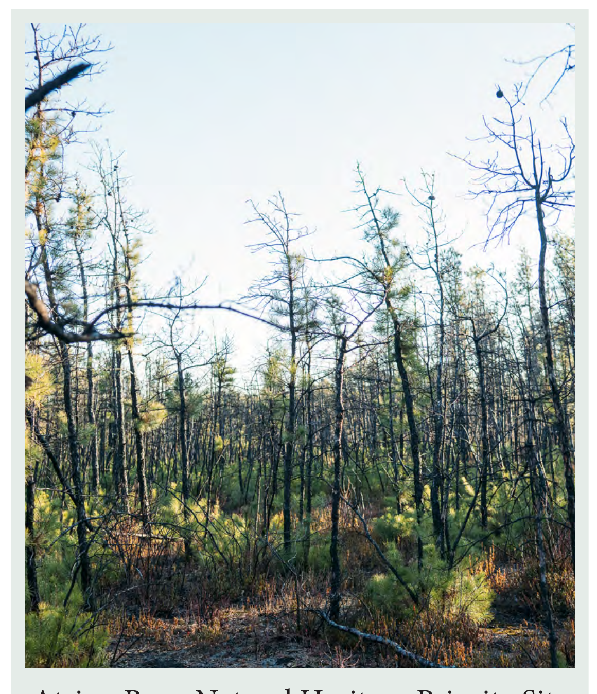
Atsion Burn Natural Heritage Priority Site

Natural Heritage Priority Sites represent some of the best remaining habitat for rare "plant" species and ecological communities in New Jersey. Refer to the map legend for the 11 sites within Wharton.