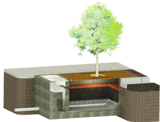
Bypass Weir Model