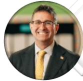
Delaware Governor, Matt Meyer, DRBC Vice Chair