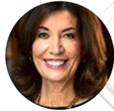
New York Governor, Kathy Hochul, DRBC Chair