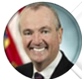
New Jersey Governor, Phil Murphy