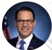
Pennsylvania Governor, Josh Shapiro