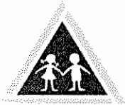
Exhibit "J-20" Sheet #8

Metuchen Board of Education 16 Simpson Place Metuchen, NJ 08840-1827