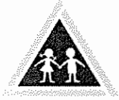
Exhibit "J-20" Sheet #3