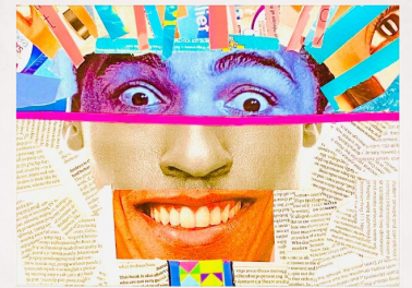
Dickinson High School Jersey City Public Schools Hudson County

"The New Now" exhibit was on display at The Art House Gallery in North Jersey.