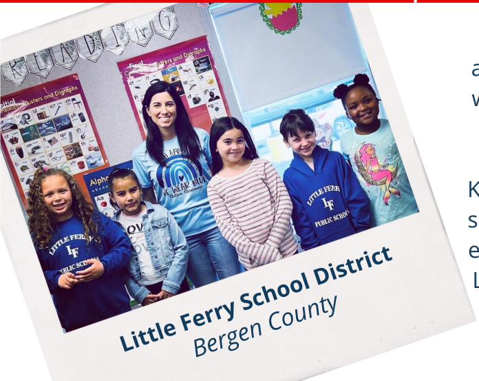
Little Ferry School District Bergen County

Little Ferry School District celebrated Autism Awareness across the month of April. They began the celebrations by wearing blue in support of students with autism, followed by monthly celebrations that included: "Team Up for Autism", "Hat Day", "Get Comfy with Autism", and "Royal Knights Together." Each event was purposefully selected to show the student body that they are all on the same team, everyone is welcomed, and they are all Mighty! #BeMighty. Little Ferry noted that "this event was able to highlight our amazing students and everything they have to offer no matter what their challenges may be."