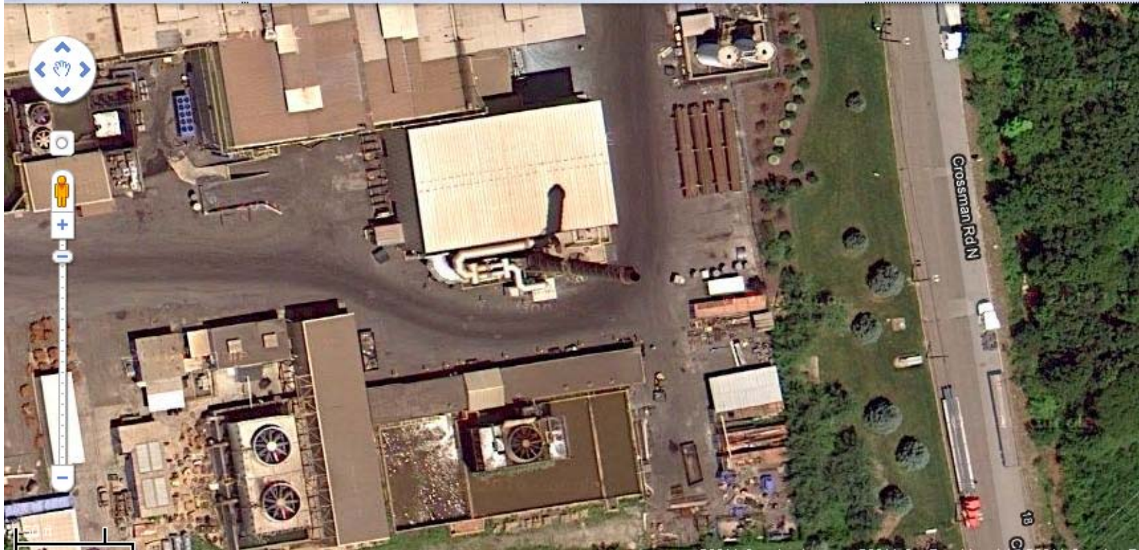
Figure 2: Location of the stack at the Gerdau Ameristeel Recycling Plant