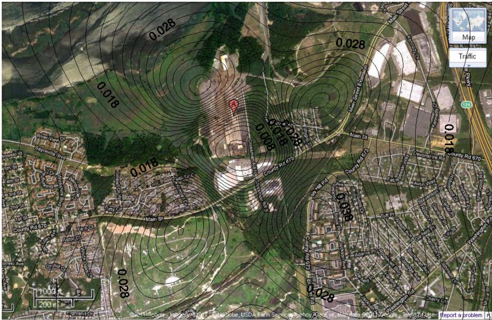
Figure 3: Iso-concentration lines ( \mu\text{g}/\text{m}^3 ) for unit stack emission (gm/sec) for the Gerdau Ameristeel Recycling Plant