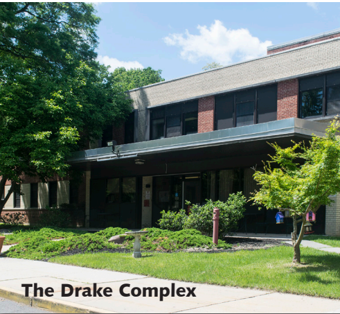
The Drake Complex

The hospital is divided into 4 primary sections. Each complex has unique functions but is interdependent with other parts of the hospital.