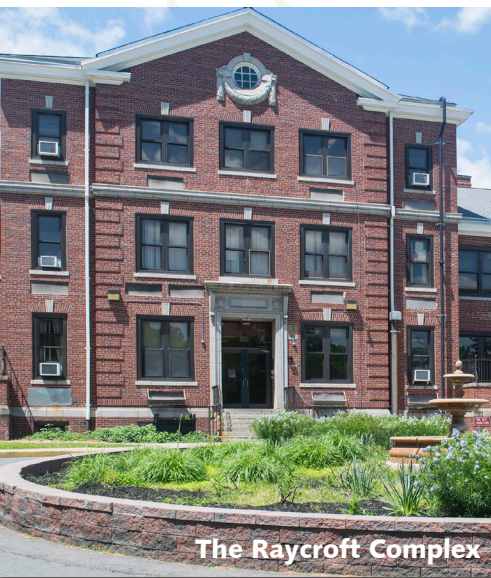
The Raycroft Complex

The Drake Complex is composed of three coed, locked admissions units. Psychologists assess and treat involuntarily committed patients who present with acute symptoms, such as delusions and hallucinations, and behaviors including suicidality and aggression. In addition, interns gain a familiarity with the care of patients who have significant legal issues including those on Detainer status, those found Not Guilty by Reason of Insanity (NGRI), those court ordered to be evaluated for competence to stand trial, and those who are Megan’s Law registrants. Treatment occurs in the context of a Treatment Mall setting within the Drake Complex which offers centralized programming to individuals in all three admissions units and aims to stabilize, support and ultimately discharge patients. Patients may stabilize quickly and return to the community or progress to other hospital units for further treatment. The intern placed in Drake gains experience and training on the unit where his or her primary supervisor provides psychological services and gains assessment experience where his or her assessment supervisor is assigned.