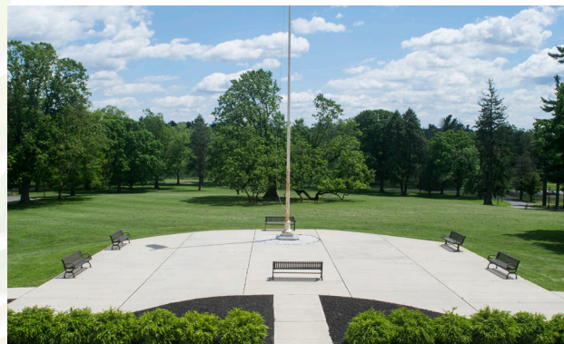
The Hospital Campus

Hospital – Including but not limited to NJ Policy Against Discrimination, Equal Employment Opportunities and Affirmative Action (3.001), Sexual Harassment (3.001.01), Code of Ethics (2.401.17), TPH Employee Physical Exam Guidelines/Pre-Employment Health Screening for New Hires (3.305), Employee Physical Exam Guidelines: Assessment of Physical/Mental Incapacity (3.305.01), Research Review Committee (5.401), Guidelines for Use of Information Technology Resources (1.801), and Patient Abuse and Neglect (1.901). For a complete description of a particular hospital policy and procedure, current interns can visit our Intranet homepage at http://tphweb/ and click “Template and Policy Search”. Type in a policy number or key word. Applicants may receive policies upon request via email.