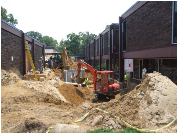
Photos: Before & After Photos Academic & Administration Building Renovations