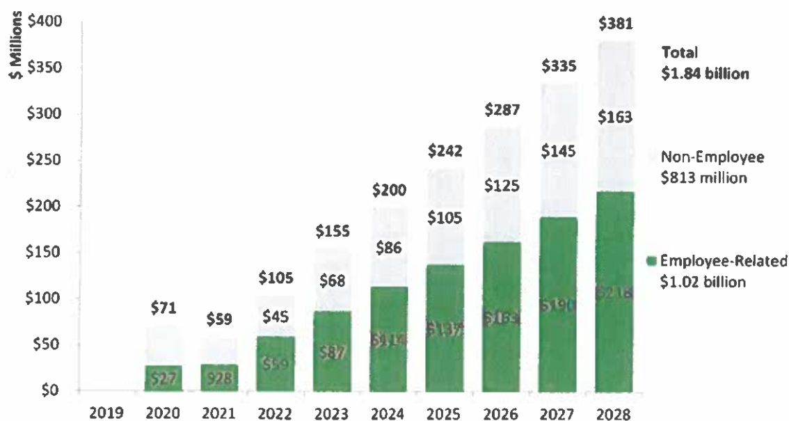
Figure 3.1: Additional Operating Expenditures in New Jersey due to Form Change, 2019-2028

Source: ESI analysis of Horizon projections