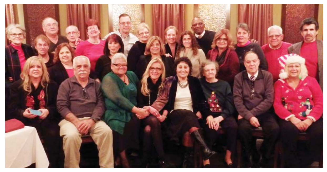
Group photo from NJ School for the Deaf/Marie Katzenbach