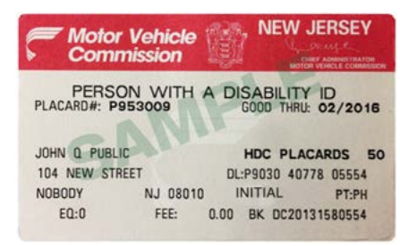
FIGURE 2: Permanent Person with a Disability Placard