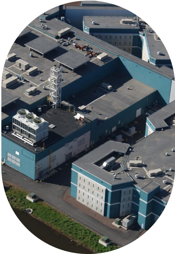
Photo of Essex County Correctional Facility