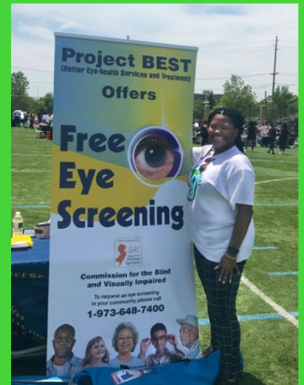
Multiple divisions at NJ Human Services were out-in-force at First Lady Tammy Murphy's Family Festival in Newark.