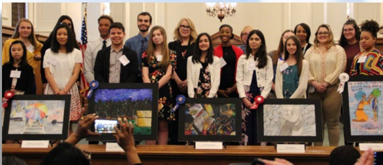
Human Services honored 16 New Jersey high school and middle school students for their winning entries in the 2019 New Jersey Child Support Teen Media Contest, which celebrated the artistic and written portrayal of situations when the students felt most supported by a parent or loved one.