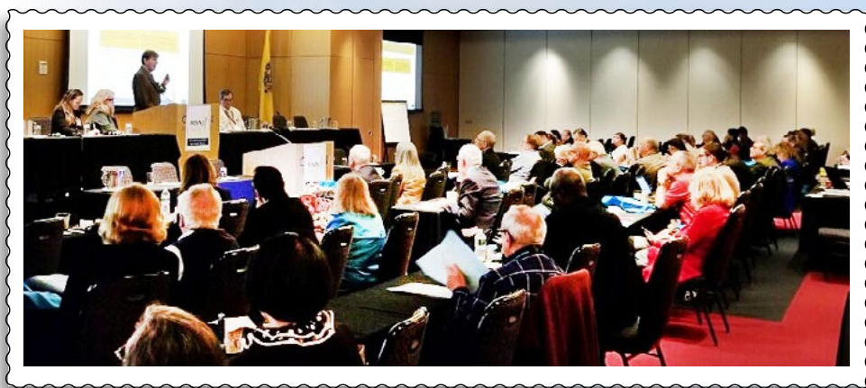
Human Services had an important discussion with the Medical Society of New Jersey about Murphy Administration's efforts to support physicians providing medication-assisted treatment for opioid addiction.