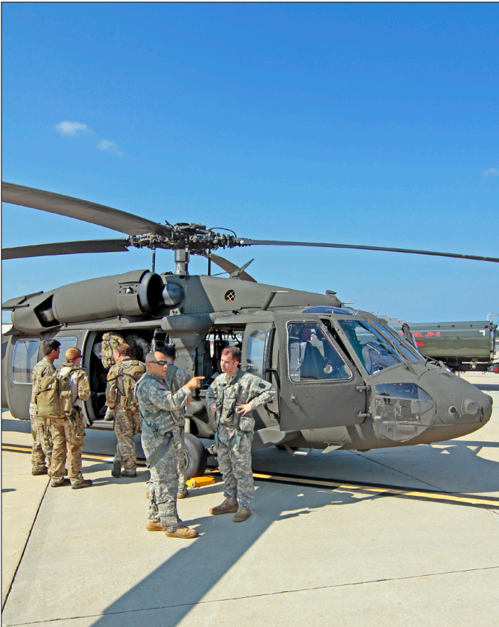
Members of the 227th Air Support Operations Squadron, 177th Fighter Wing, New Jersey Air National Guard, prepare for a training mission in conjunction with the 1-150th Assault Helicopter Battalion at the 177th Fighter Wing, Egg Harbor Township, Aug. 8.