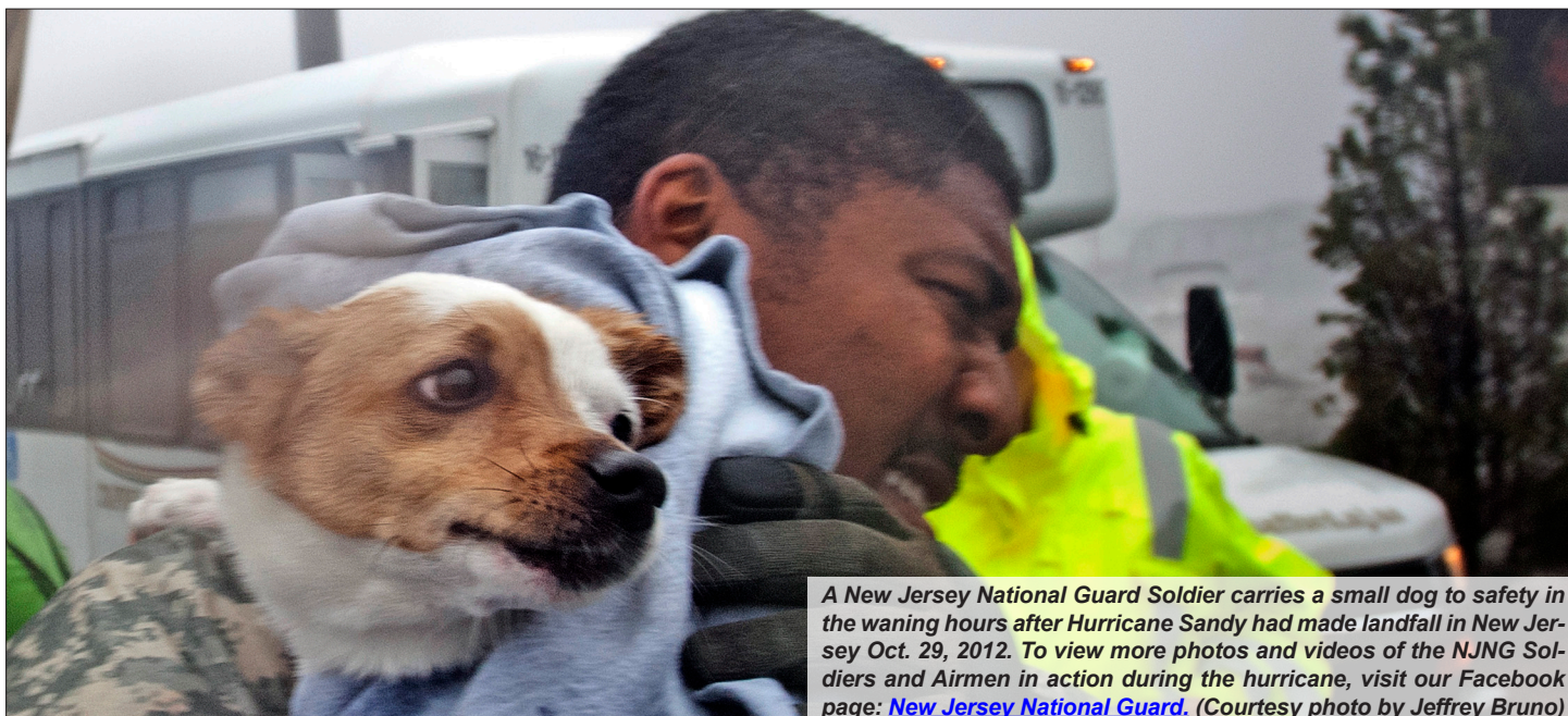
A New Jersey National Guard Soldier carries a small dog to safety in the waning hours after Hurricane Sandy had made landfall in New Jersey Oct. 29, 2012. To view more photos and videos of the NJNG Soldiers and Airmen in action during the hurricane, visit our Facebook page: New Jersey National Guard .