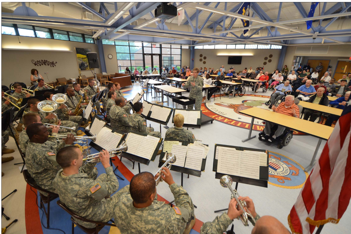
The 63rd Army Band, New Jersey Army National Guard, entertains residents at the New Jersey Veterans Memorial Home at Paramus, July 1,