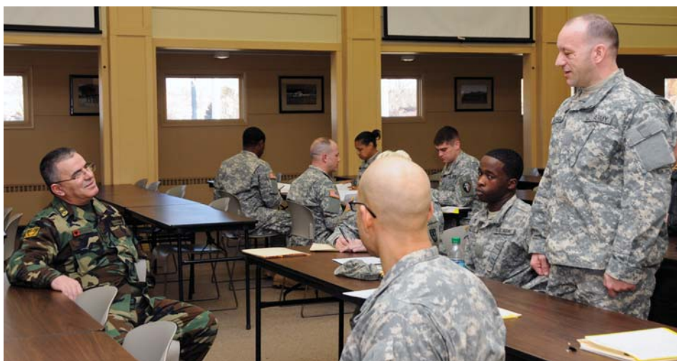
Brig. Gen. Hoxha talks with Soldiers from the current officer candidates at the National Guard Training Center.

The SPP supports U.S. national interests and security cooperation goals by engaging partner nations via military, socio-political and economic conduits at the local, state and national level.