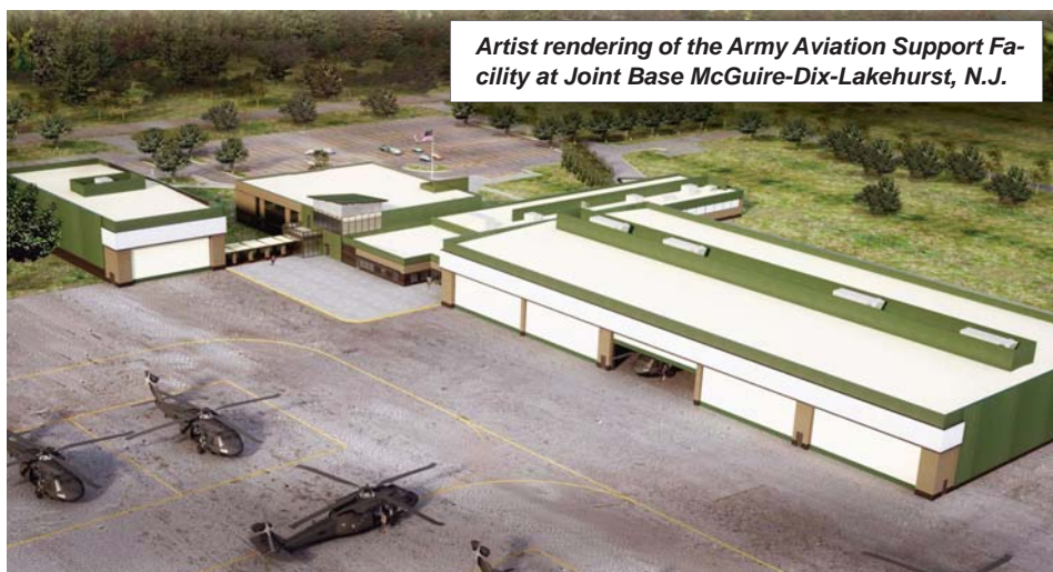
Artist rendering of the Army Aviation Support Facility at Joint Base McGuire-Dix-Lakehurst, N.J.

"The men and women of the 1-150th Aviation Battalion have proven their capabilities and commitment to service both at home and abroad," he said.