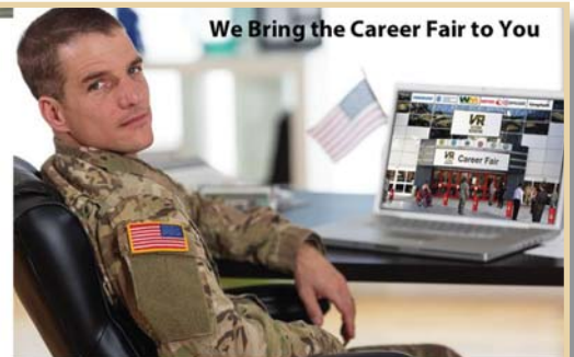
We Bring the Career Fair to You

Take the First Step by Registering Today www.vetcareerfair.com