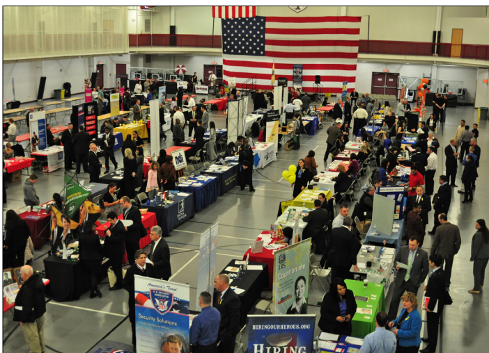
More than 110 veterans looking for jobs got the opportunity to meet with employers at the Hiring Our Heroes job fair held at Rider University March 21, 2013. The Rider student recreation center floor in Lawrenceville was filled with more than 70 employers and 19 veteran service organizations. Veterans can use the Hero To Hire website https://h2h.jobs/ to start a job search.

With an annual allocation from DMHAS of $850,000, CCGNJ works with 35 agencies statewide to provide education and treatment to problem gamblers and maintains a 24-hour confidential hotline, 1-800-GAMBLER and the website http://www.800gambler.org that lists additional resources.