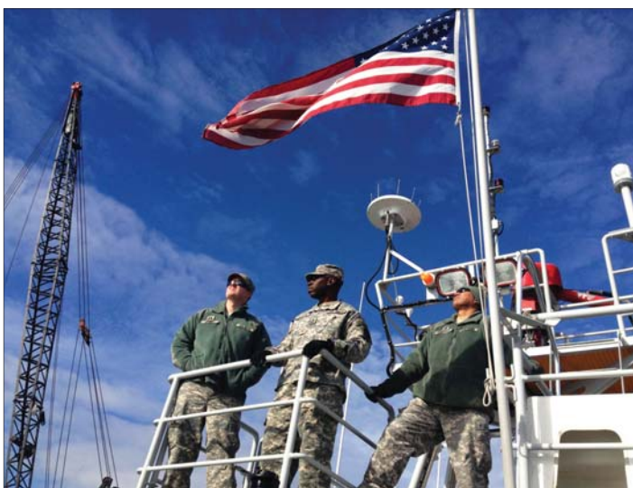
Soldiers from the 21st Civil Support Team (Weapons of Mass Destruction) participate in a maritime familiarization training with the Portland Fire Department Maritime Division, Maine, Nov. 5, 2013.