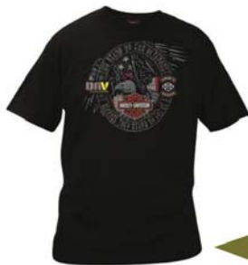
Stratman Harley's Heros Collectible T-shirt all proceeds from T-shirt sales goes to the DAV