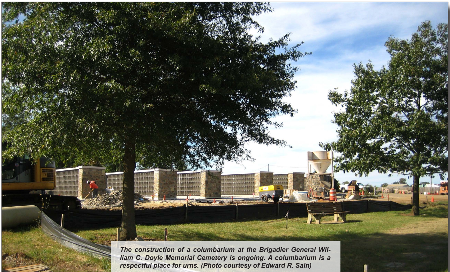
The construction of a columbarium at the Brigadier General William C. Doyle Memorial Cemetery is ongoing. A columbarium is a respectful place for urns.