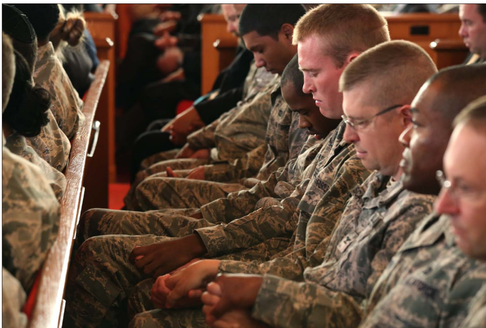
New Jersey National Guard Soldiers and Airmen attend a memorial service in Newark on Oct. 29, 2013 in memory of the 71 people killed by Superstorm Sandy.