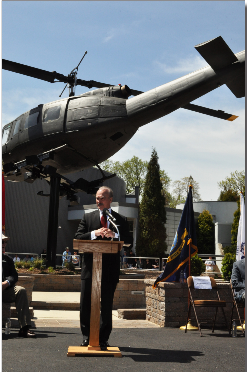
Former Pittsburgh Steelers running back Rocky Bleier, who became a four-time Super Bowl champion after a long rehabilitation from wounds sustained as an infantryman in Vietnam, was the keynote speaker at New Jersey Vietnam Veterans Remembrance Day.

“It may be a little late but this is our way of saying thank you,” she added. “Thank you for your service and welcome home.”