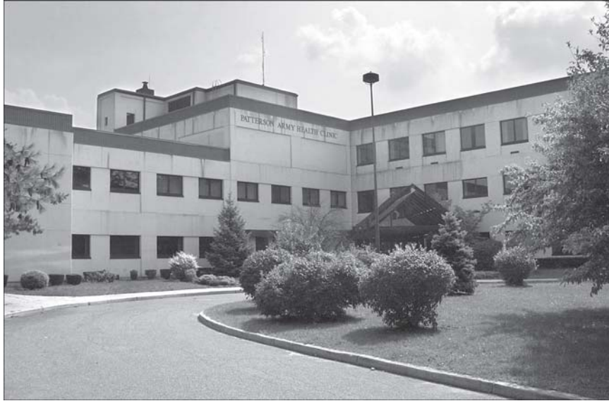
Patterson Army Health Clinic as it appears today.