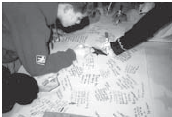
Long Valley Middle School eighth-grade students sign the Holiday Scrolls for New Jersey's deployed servicemen and women.

to new scrolls. In addition to the Long Valley students, hundreds of visitors to the Educational Center have written