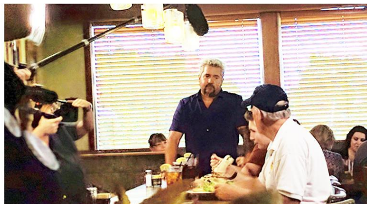
An episode of Food Network’s “Diners, Drive-Ins and Dives,” starring celebrity chef Guy Fieri, was shot at the Vincetown Diner in Southampton.