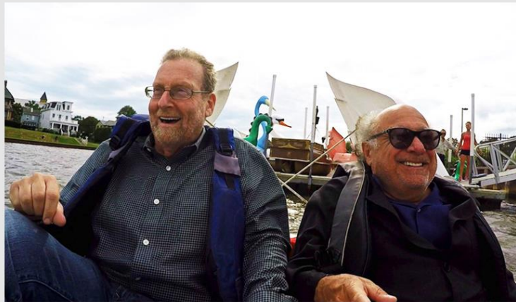
Travel Channel’s “Take Me Home,” featuring NJ native Danny DeVito, retraces the actor’s steps during his childhood years in Asbury Park.