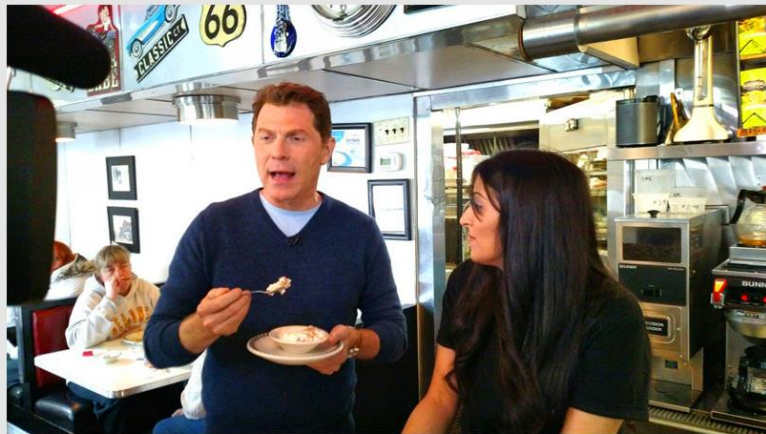
Bobby Flay visits the Broad Street Diner in Keyport for a segment of “CBS Sunday Morning”