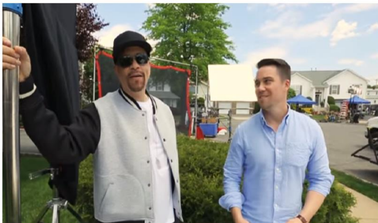
Geico’s popular “Lemonade, Not Ice-T” commercial was filmed in Clifton