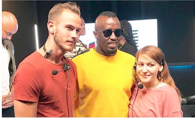
Sean "Diddy" Combs (center) serves as Executive Producer for Revolt TV's "State of the Culture." The series, hosted by Joe Budden & Remy Ma, filmed in Newark.