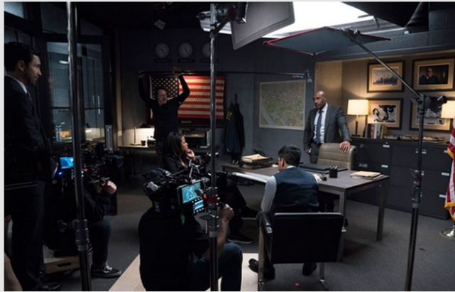
A scene from the NBCUniversal television series "The Enemy Within," starring Morris Chestnut (behind desk), filmed on sets built in the Izod Center in East Rutherford.