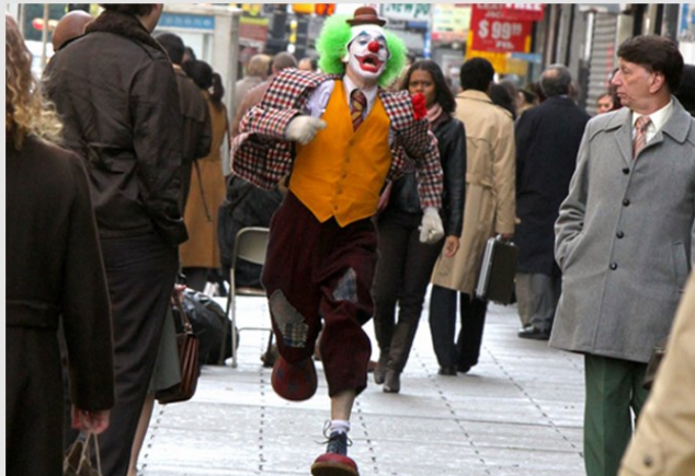
The streets of Newark (pictured) and Jersey City were transformed into Gotham City for the Warner Brothers feature, "Joker," with Joaquin Phoenix and Robert De Niro.