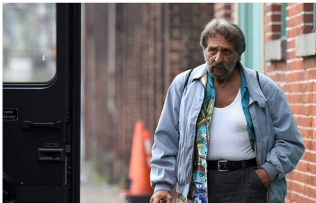
Al Pacino (pictured) co-stars with Robert De Niro and Joe Pesci in Martin Scorsese's Netflix feature, "The Irishman." Filming took place in Paterson.